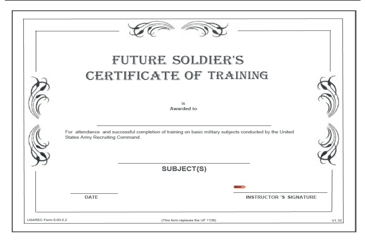
Figure C-2. Example UF 5-03.5.2- Future Soldier Certificate of Training