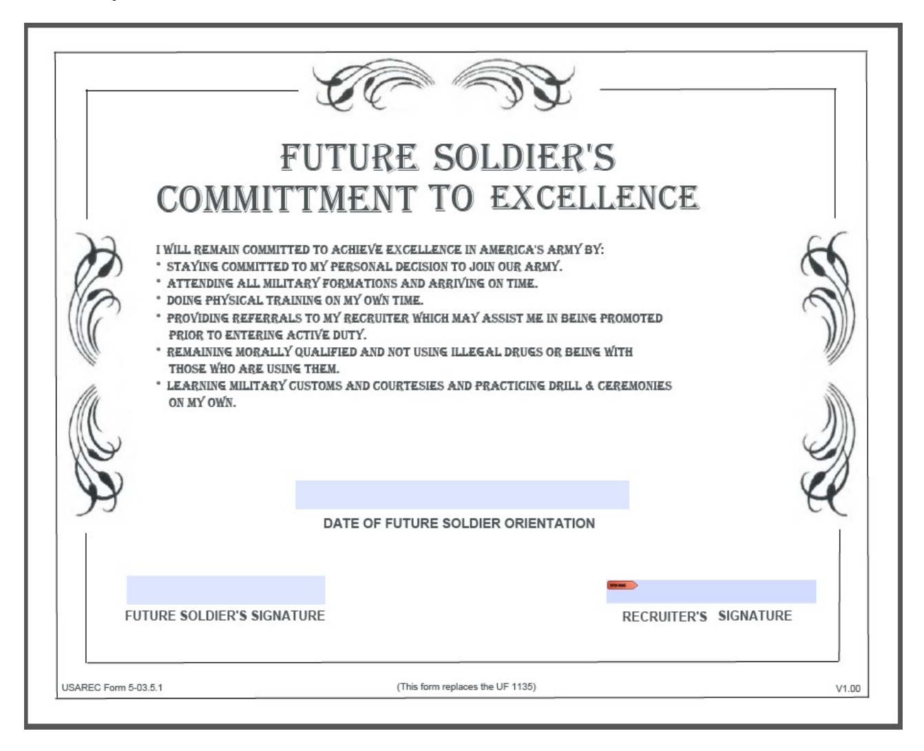
Figure C-1. Example UF 5-03.5.1-Future Soldier Commitment to Excellence Certificate

C.1 Within this section, you will find certificates that can be useful and assist the Recruiter and Station Commander with their Future Soldier Training Program. These certificates are not mandatory but will assist you in developing and maintaining a well- managed Future Soldier Training Program. USAREC Form 5-03.5.1, Future Soldier Commitment to Excellence (Figure C-1) is a contract between the Future Soldier and his or her Recruiter. USAREC Form 5-03.5.2, Future Soldier Certificate of Training (Figure C-2) is a great method to recognize Future Soldiers that attend training sessions and complete training modules. USAREC Form 5-03.5.3, Future Soldier Referral Promotion Certificate (Figure C-3) is a great example of a certificate to recognize a Future Soldier that is promoted for meeting all specified requirements outlined in USAREC Regulation 601-210. USAREC Form 5-03.5.4, Certificate of Enlistment (Figure C-4) is a good example of a certificate used to signify acceptance and enlistment into the United States Army.