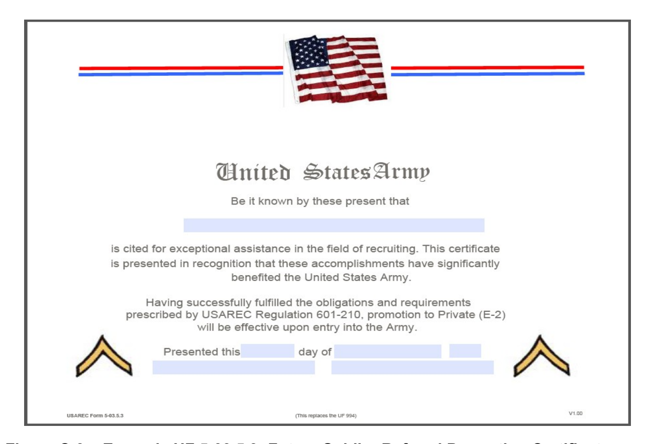
Figure C-3. Example UF 5-03.5.3- Future Soldier Referral Promotion Certificate